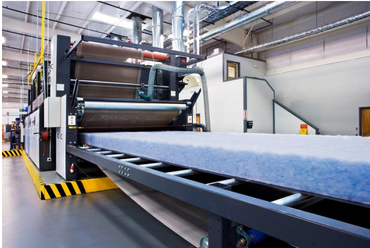
Picture 1: Customised process belt solutions made by GKD offer a wealth of potential for optimisation in demanding production processes.