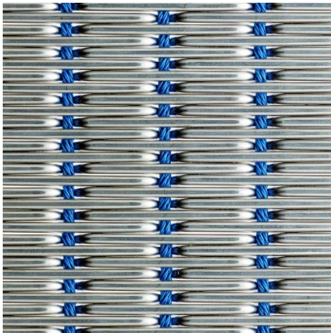
Picture 3: V-crimp type belts with ultra-stable special plastic cables woven in parallel to the running direction.

Ursula Herrling-Tusch Charlottenburger Allee 27-29 D-52068 Aachen Tel: +49 [0] 241 / 1 89 25-10 Fax: +49 [0] 241 / 1 89 25-29 E-Mail: herrling-tusch@impetus-pr.de