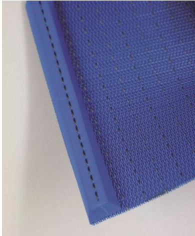
Picture 1: Wedge bar for self-guidance of the process belts by GKD for the nonwoven industry.